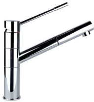
Mixer Tap Lorenzo 8466 000