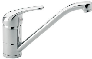
Mixer Tap S1000 - RO 8443 002